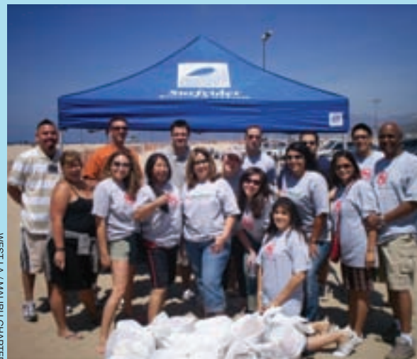
WEST LA / MALIBU CHAPTER

Through the Help for Communities program, Beneficial encourages its employees to volunteer at least two days per year to causes in their region. Besides giving employees a great way to give back to their community the event was also a great way for participants to put a face with the name of their co-workers, as participants represented multiple branches of the company. As part of this partnership Beneficial/HSBC also made a generous donation of $4,000 to Surfrider Foundation's West LA / Malibu Chapter . The bank supports initiatives that minimize the impact of pollution and depletion of resources and through their efforts helps to conserve land and water-based ecosystems and habitats while raising awareness and addressing environmental issues.